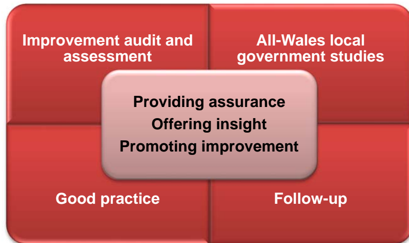
Exhibit 4: Components of my performance audit work